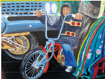
ORIGINAL ARTWORK BY CRUZ LÓPEZ

MURAL UNVEILINGS WITH ARTISTS: NEAR 500 US-285, ESPAÑOLA, NM (PARK IN OLD HUNTER FORD LOT OR PARK AND RIDE LOT-- WHERE YOU'LL SEE THE FIRST MURAL "3-HEADED HYDRAS", "100%" AND "SPAÑA"). NEAR THE CORNER OF PASEO DE OÑATE AND CALLE ESPINOSA, A SHORT STROLL FROM THE PLAZA.